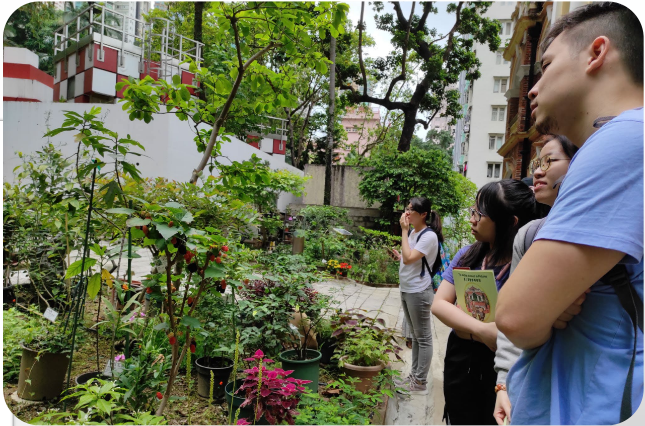
ASCI students taking AST20215 Molecular and Microbiology course enjoyed the visit