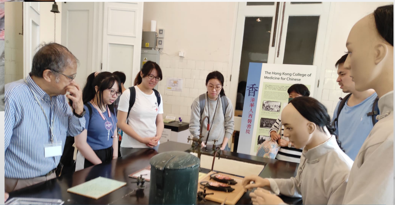
Visiting the Historic Building and Ancient Laboratory