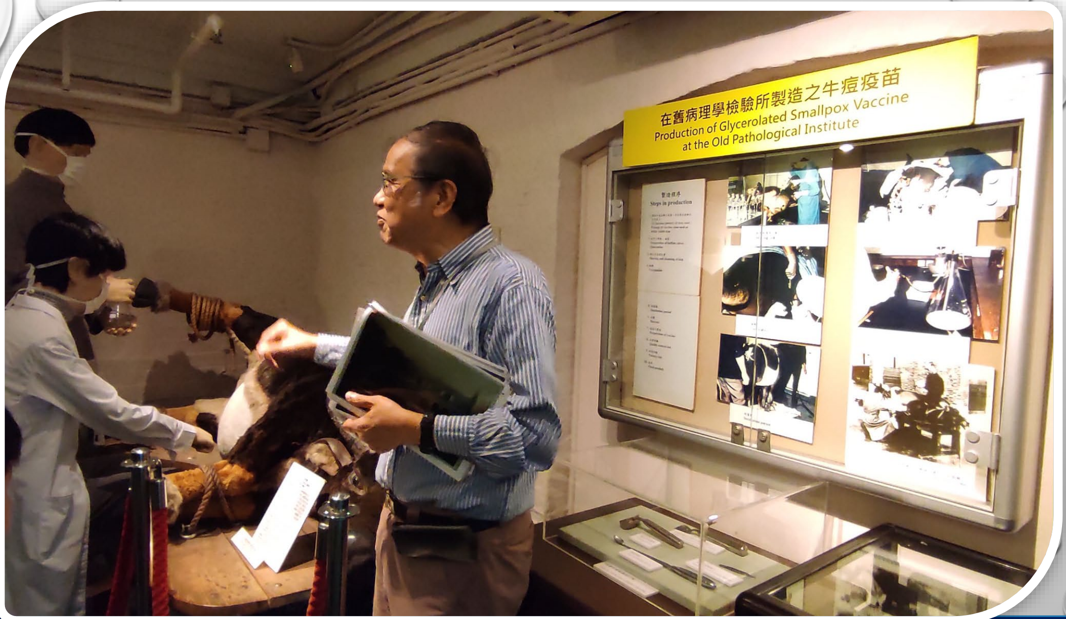
Docent explaining the development of vaccines