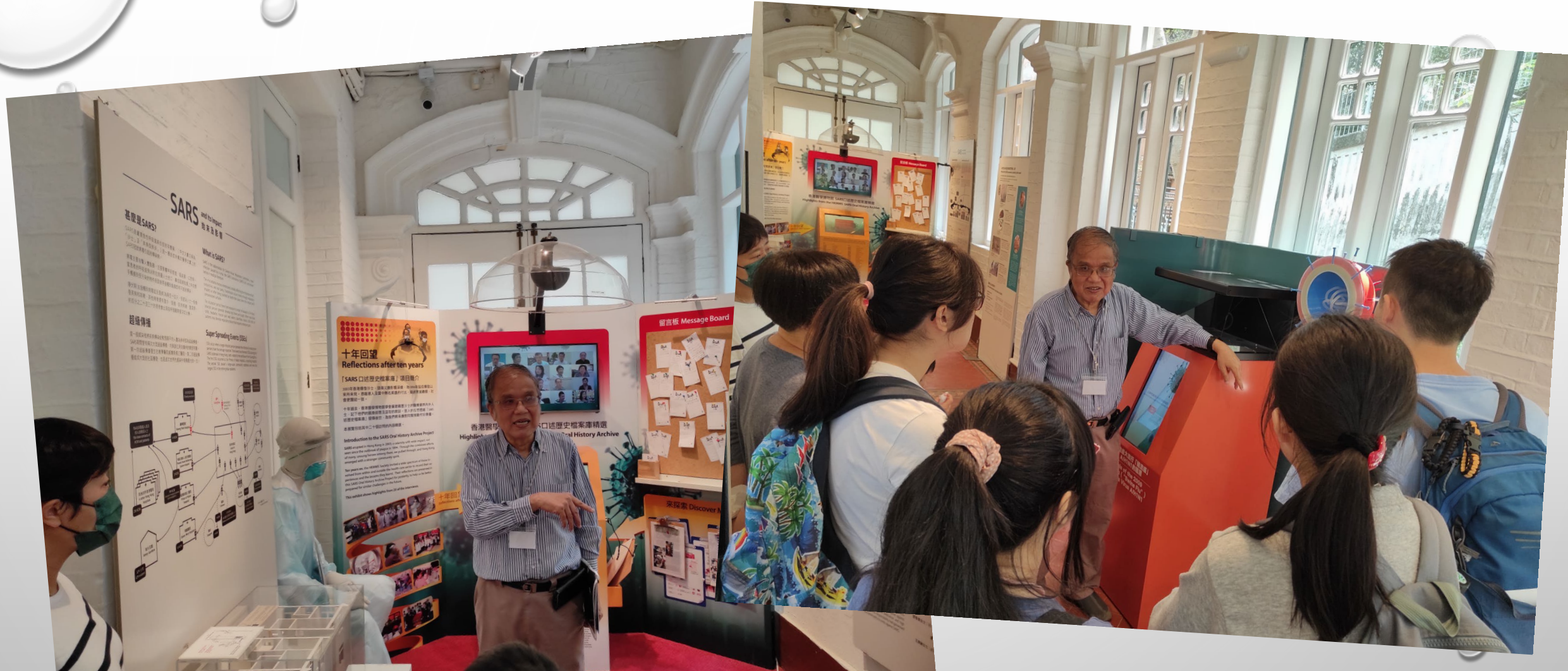
Left : Learning Infectious Diseases – SARS Right : Exploring virus model