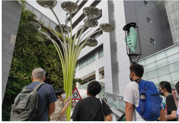
Staff briefing the energy saving concepts