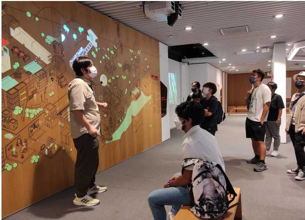
Introduction by EMSD staff